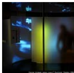
Espace sensoriel Armani